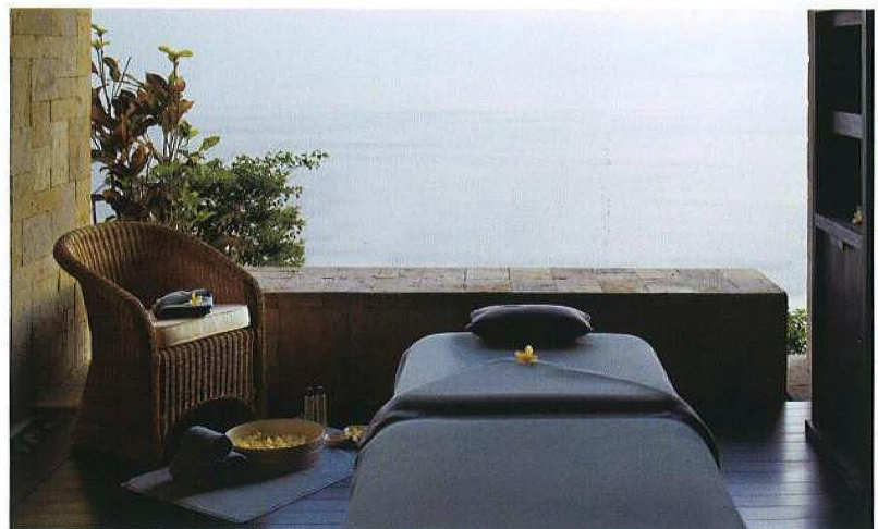
Above: Enjoy a spa treatment with unrivalled ocean views at Bulgari Resort, Bali. Left: The villas at Bulgari Resort skillfully fuse Balinese style with dramatic contemporary Italian design.

"With its dramatic setting on a secluded plateau 160 metres above the Indian Ocean dropping straight to the sea, as well as its breathtaking natural beauty that offers unrivalled views across the vast expanse of the Indian Ocean which no other areas could compare, the Bulgari Resort