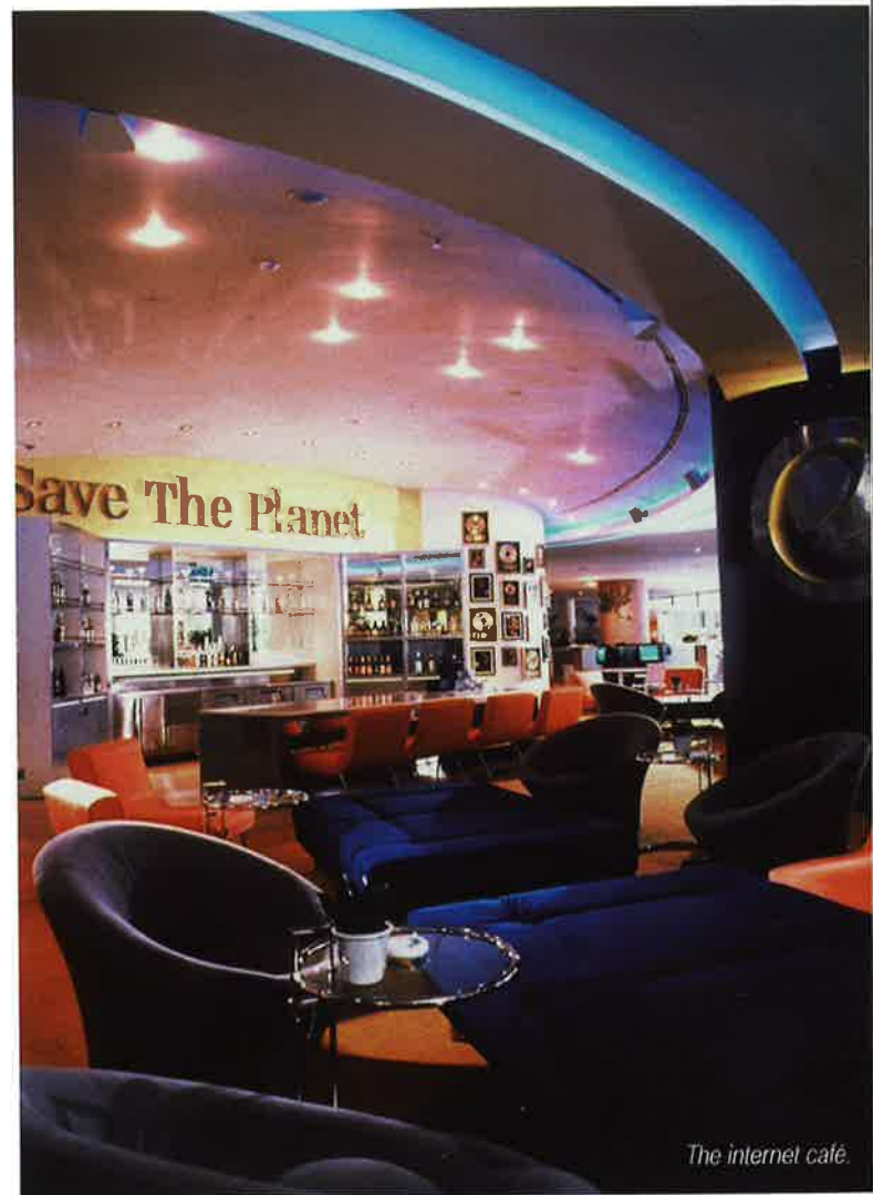
The internet café.