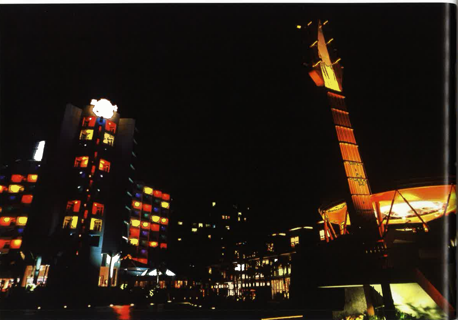
The Exterior of the Hard Rock Hotel, Pattaya.