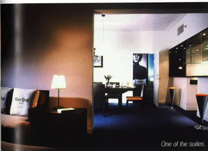
One of the suites.