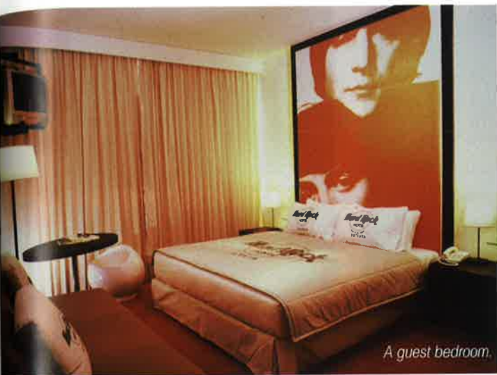
A guest bedroom.